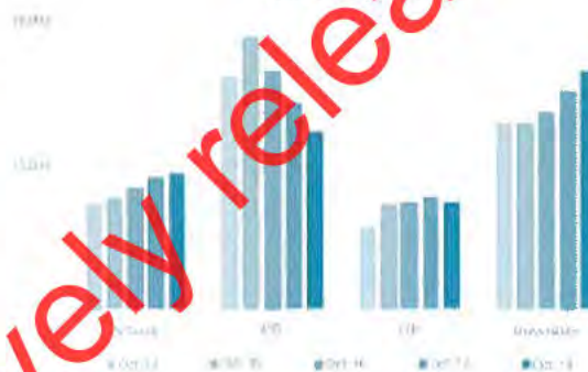
Total VSV by sector