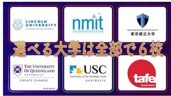
Participating Schools (Each School Logo)