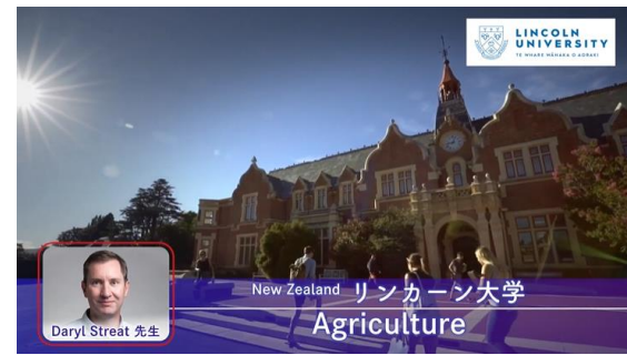
Instructor Name / Face Photo / School Appearance