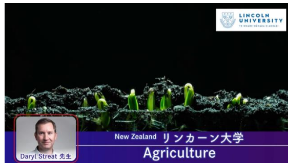
Material Videos related to lecture theme or lecture scenery, etc. (About 7 to 8 seconds each x 6 schools)