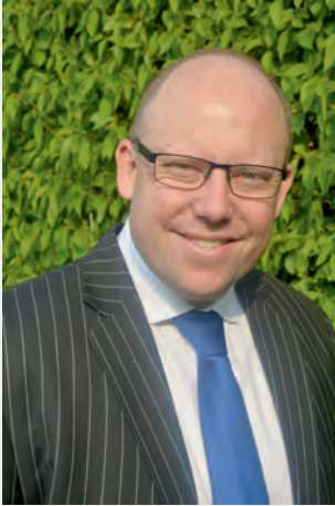
Grahame Morton High Commissioner to India, Sri Lanka, Bangladesh and Nepal

New Zealand and India enjoy a long standing and a very positive relationship. We share a Commonwealth heritage, legal system, English as business language, democratic relations and a shared passion for the sport of cricket. New Zealand is home to over 150,000 people of Indian origin (4% of total population), with Hindi as the fourth most spoken language.