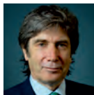
Message from Derek McCormack Vice Chancellor AUT University

AUT is New Zealand's second largest and fastest growing university. More than 28,000 students study at our three campuses across Auckland – the country's fastest growing city. In 2016 our students were born in 140 countries.