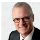
Message from Hon Steve Maharey Vice Chancellor Massey University

Located in Wellington, New Zealand's capital, Massey University's College of Creative Arts, founded in 1886, offers Bachelors, Postgraduate Diploma, Masters and PhD level study in Industrial, Visual Communications, Textiles, Fashion, and Spatial Design, as well as Photography, Fine Arts, Creative Media Production and Commercial Music (Practice, Technology, and Industry). The College also offers undergraduate and postgraduate study in Māori Visual Arts in Palmerston North.