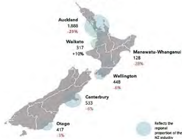
Total YTD FSV by region Growth/Decline